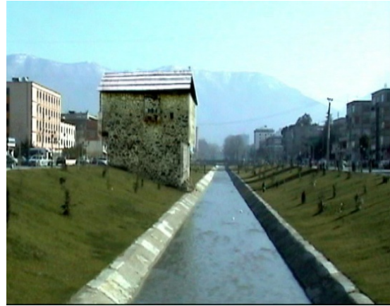
Frame video river lana Tirana Albania