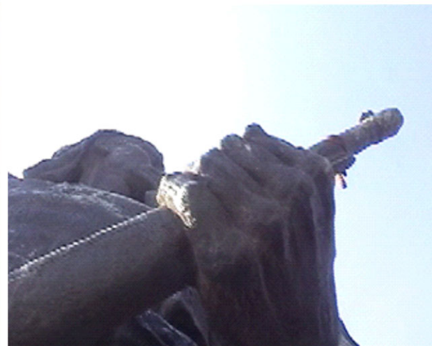
Frame video 3:35 min