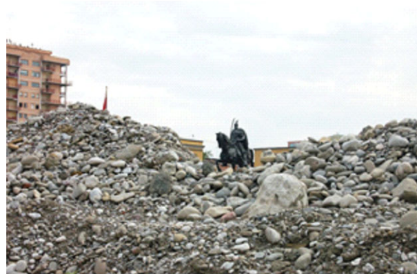
Frame video "Skanderbeg square Tirana Albania