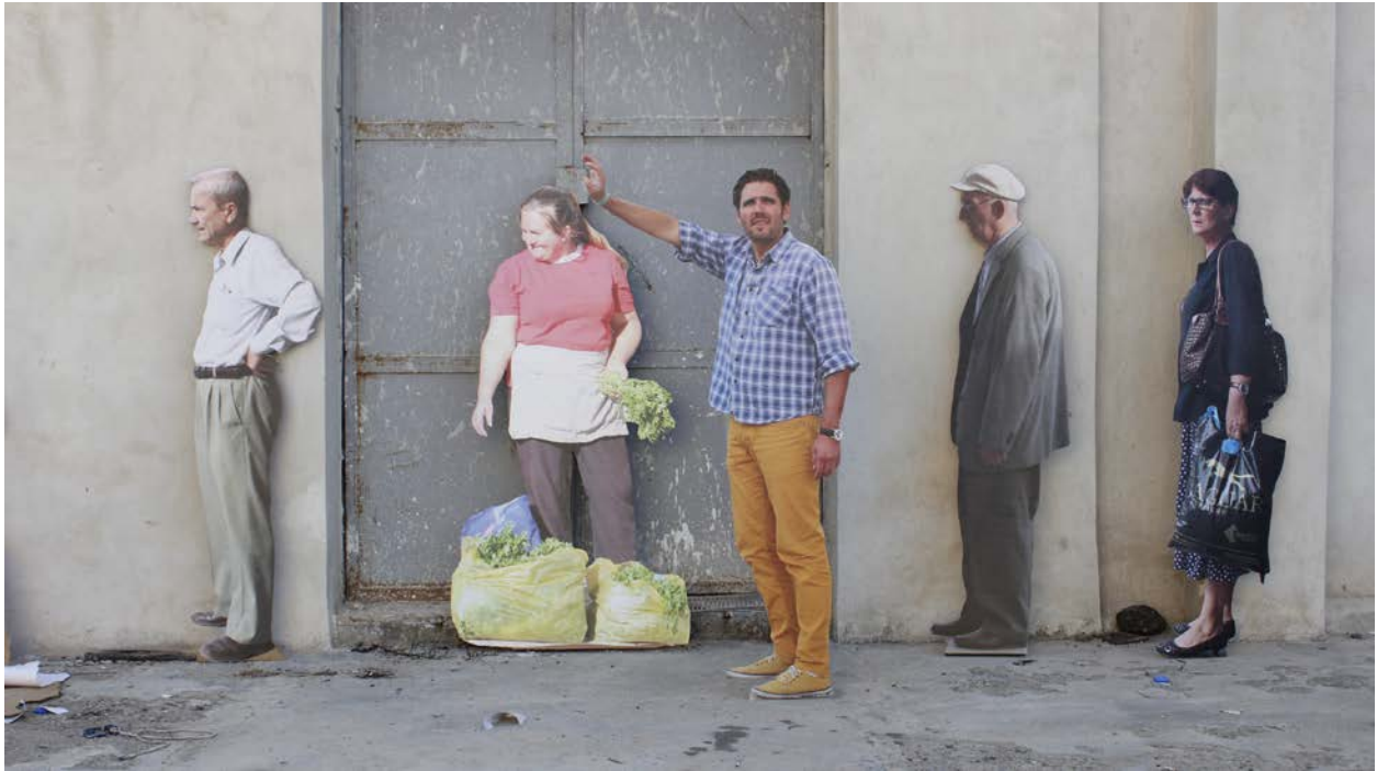
Mirage street 20015 instalation /180:50x7 cm , on street Tirana-Shkodra Albania