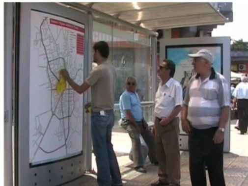
frame video Tirana Albania

Urban action:bus Bus stops video documentation of action 4:58 min 2006.