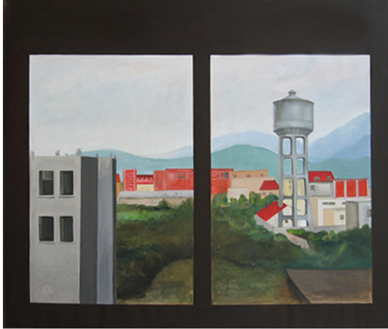
From Home (oil on canvas 2009) Oil on canvas 140x160 cm 2009