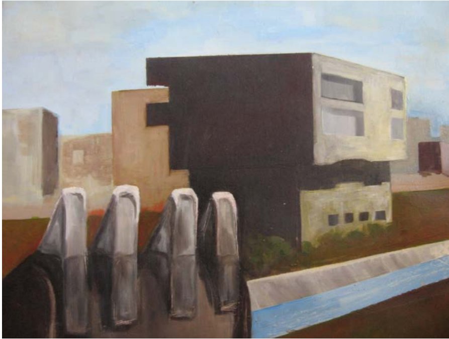
Lumi Lana (Oil on canvas 2010 )