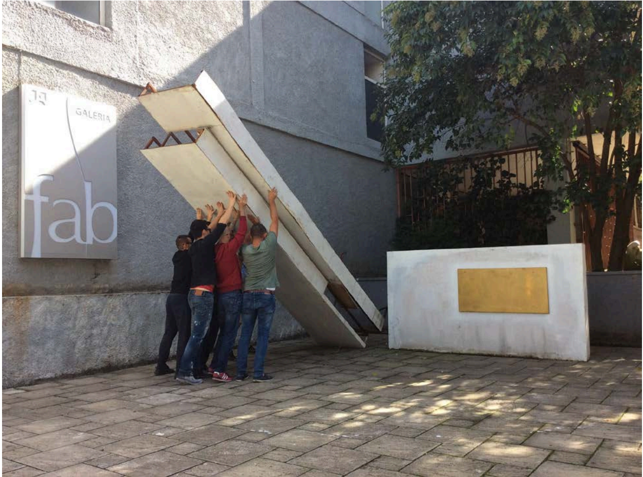
Instalation /450x:350x60 cm / Galery FapTirana Albania