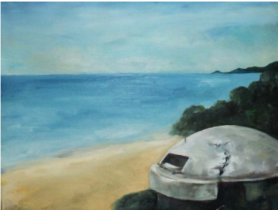
Dures hills (Oil on canvas 2010)