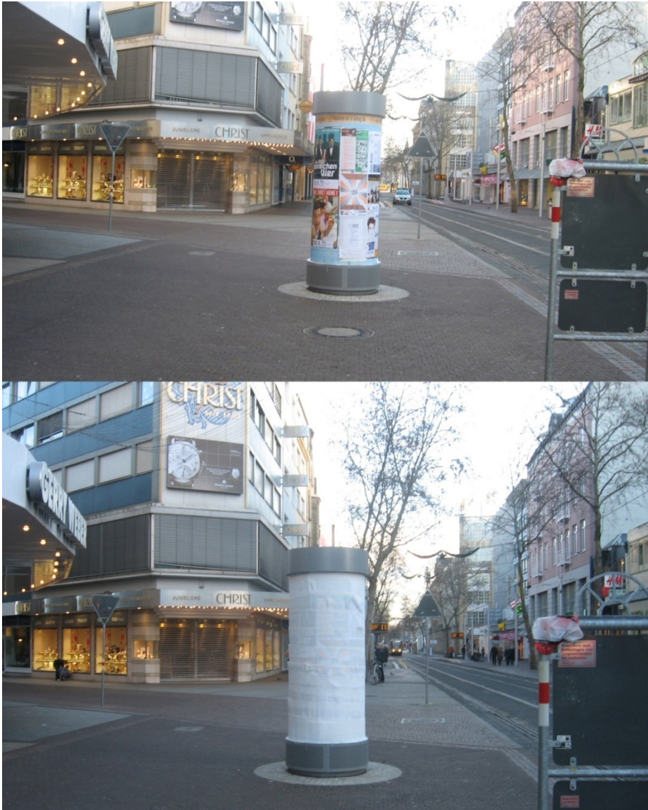
Frame video documentation Karlsruhe Germany 2007

This is image (video documentation of action 3:50 2007)