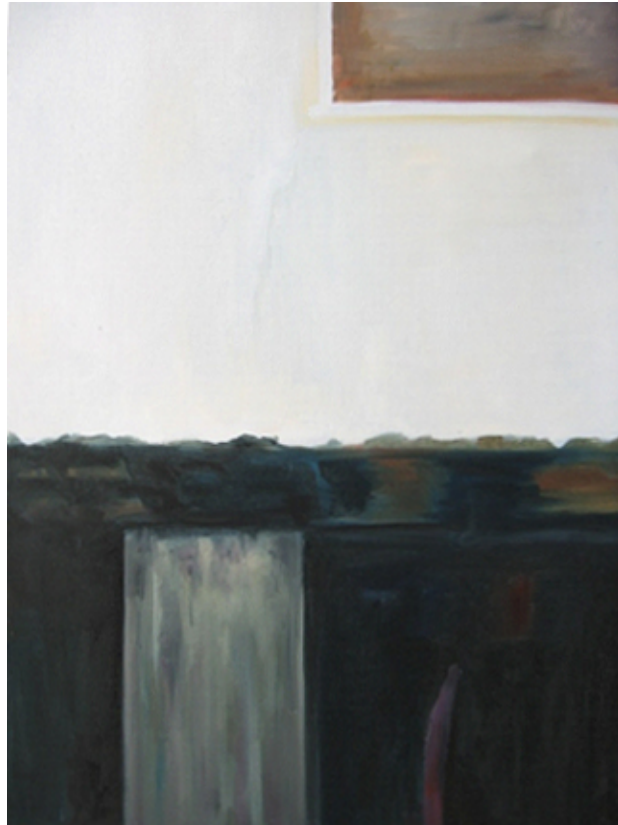
New home (oil on canvas 2011) 100x70cm