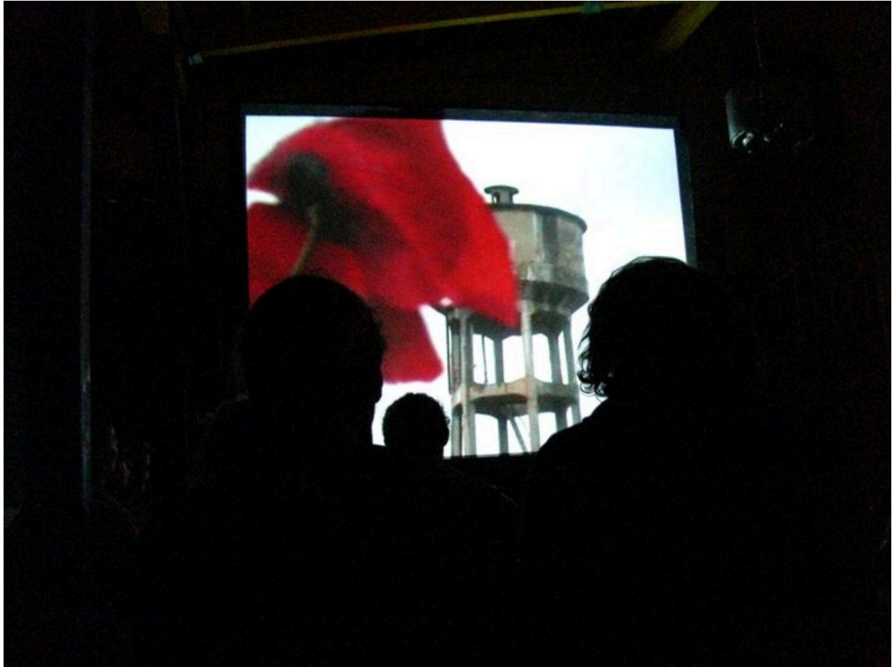
Frame video 3:30min

To be completed “Whi is afraid of the big bad crisis?” (Short film 2010)