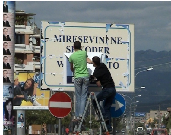
Frame video "Welcome to Shkodra" Shkodra Albania