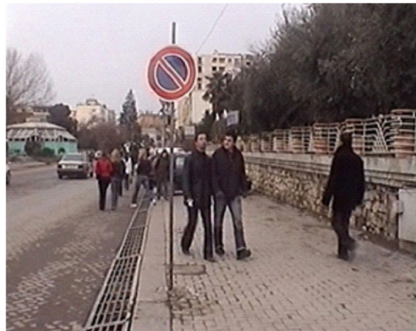
Frame video documentation of action, square Nene Teresa Tirana Albania