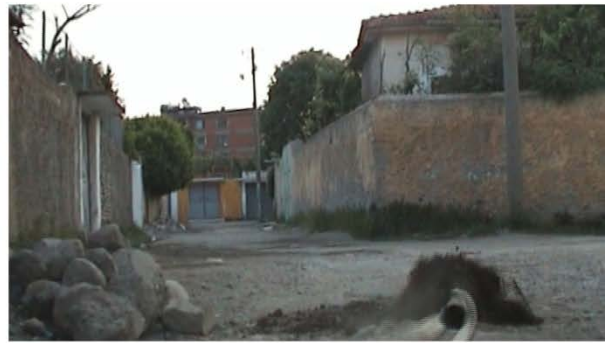
Frame video Shkodra Albania