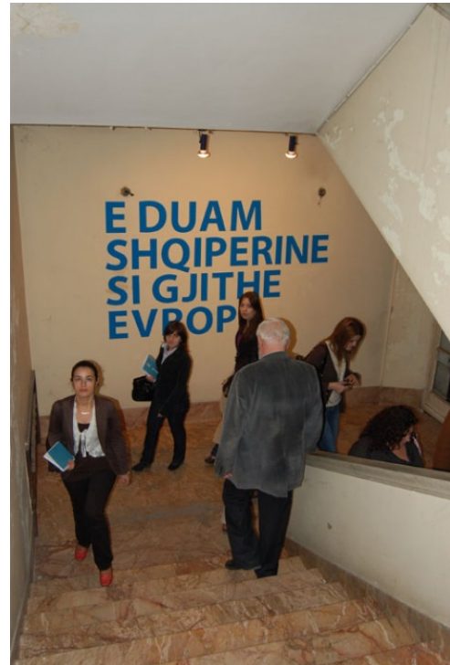
Photo: Dajti hotel Feedback Tirana Albania