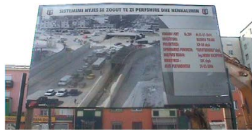
Frame video 6:55min square 'rilindja' Tirana Albania