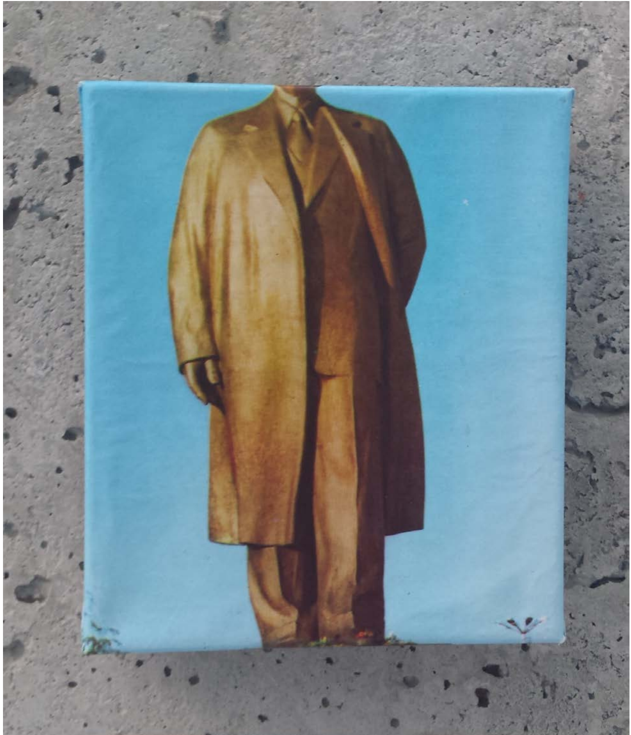
Man of gold 2015 Print on paper 10:12 cm