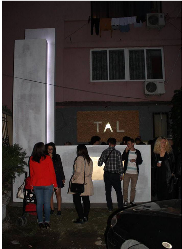
Instalation /450x:350x60 cm / Tirana Art Lab Tirana Albania

A monument, at the place where Stafa was killed was build and still exists today on a street named 5th of May, located next to the big market of the city of Tirana. The monument is surrounded by selling stands, appearing as an absurd construction in the middle of the trade center. Bujari is duplicating the original monument in original size and will install it in front of Tirana Art Lab, located in the very city center. In his new work "A Monument for a Monument", Bujari uses simple strategies of replication and relocation in order to change the context and at the same time the frame in which the monument is being taken in consideration, creating possibility for debate and re-evaluation.